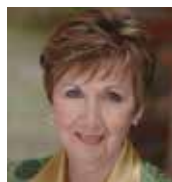
Dame Ann Murray

On the lighter side the new Operetta class (an amalgam of the G&S chorus and Parlour Music) will prepare scenes from Offenbach’s “Orpheus in the Underworld”. The Music Theatre group will work on scenes from Sondheim’s “Sweeney Todd”, and there will also be our ever-popular Cabaret class preparing their varied offerings.